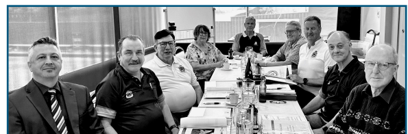
Sunday morning planning and information meeting with a difference - Committee members explore many new ideas for Cumberland sub-branch over the next five year period.

The 2023 events program will be released in the near future.